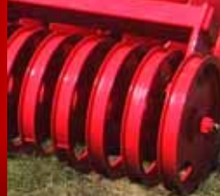
« U » roller