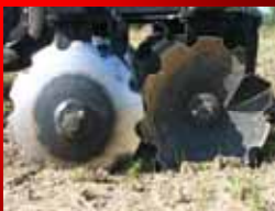
Twin notched discs