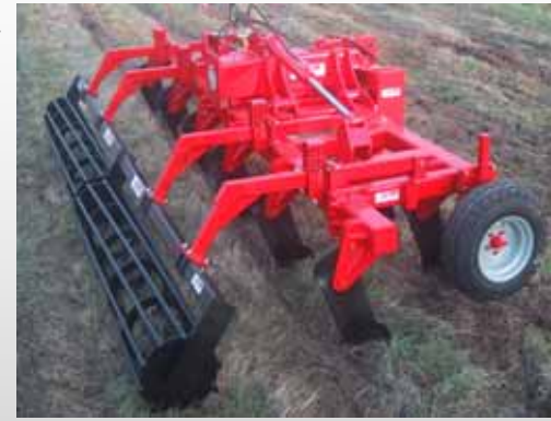
Helios R 5,00 m, 10 tines

These models all are equipped with a “Michel” tine of 800 mm, which make it possible to work up to 55 cm depth. This tine has the capacity to loosen the sub-surface ground without disrupting the top.