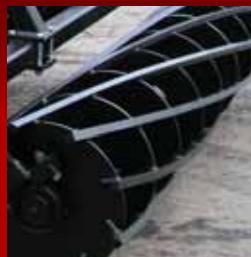
Crumbler roller Ø 500 mm