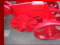
Twin & U roller