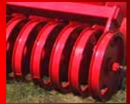
« U » roller