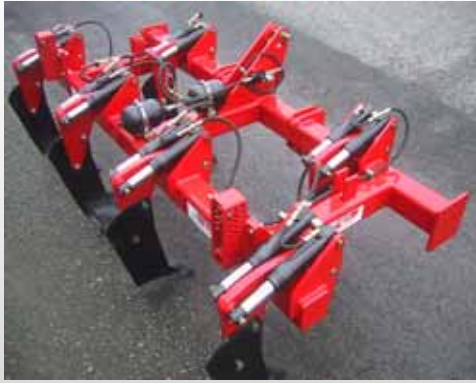
Helios 3,00 m, 6 tines

These two models are built on a frame of 160x160x10 mm with a clearance between the beams of 700 mm. The tines are laid out in “W” to limit the risks of blocking between tines while preserving a compact tool.