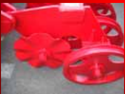
Twin & U roller

Designed with specific profiles, these rollers cut out the crop residues and mix them with the ground due to the speed effect of the implement.